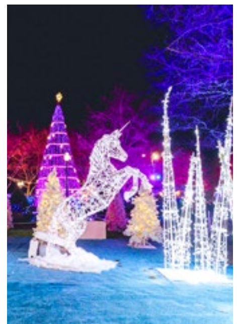
Valid for 2024 PNE Winter Fair Presented by BCAA Season

GF GLUTEN FREE V VEGAN VG VEGETARIAN DF DAIRY FREE